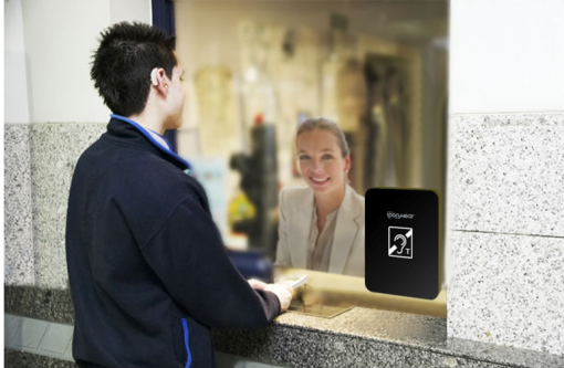
In the ticket offices and banks