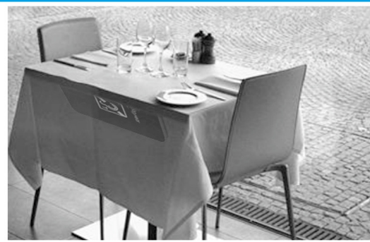
In dining rooms