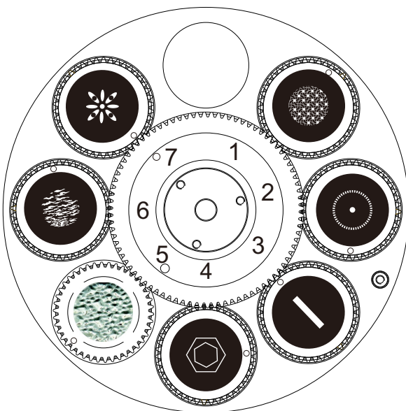
Rotating gobo wheel